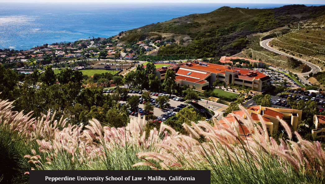
Pepperdine University School of Law • Malibu, California