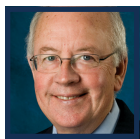
KENNETH W. STARR President, Baylor University