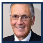
ROGER COSSACK ESPN Legal Analyst; Distinguished Visiting Professor, Pepperdine University School of Law