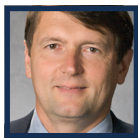
EDWARD J. LARSON University Professor and Hugh and Hazel Darling Chair in Law, Pepperdine University School of Law